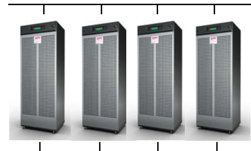
4 units in parallel