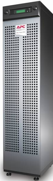
Narrow Enclosure (10/15/20 kVA)