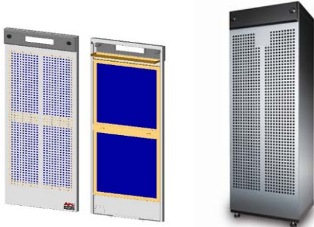
User-replaceable air filters